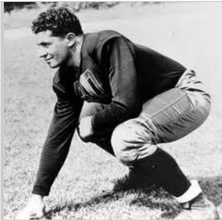
#40 Vince Lombardi, Fordham Univ., 1936

We all know Vince Lombardi from winning the first two Superbowls with the Green Bay Packers and from whom the NFL Superbowl Trophy is named. But did you know that Lombardi played and coached at Fordham University? Vince Lombardi attended Fordham from 1933-1937 and was a small, but fiery offensive lineman for the Rams. There's a vote of confidence in a time of challenge, huh!