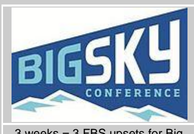
3 weeks = 3 FBS upsets for Big Sky teams